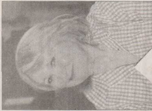
Oscar-nominated actress Teri Garr introduces her autobiography, "Speedbumps: Flooring It Through Hollywood."

film critic Pauline Kael, Garr now spends much of her time traveling the country and the world bringing hope, spirit and aplomb to those stricken by MS. She is living proof that "life is not over - I've entered a new phase."